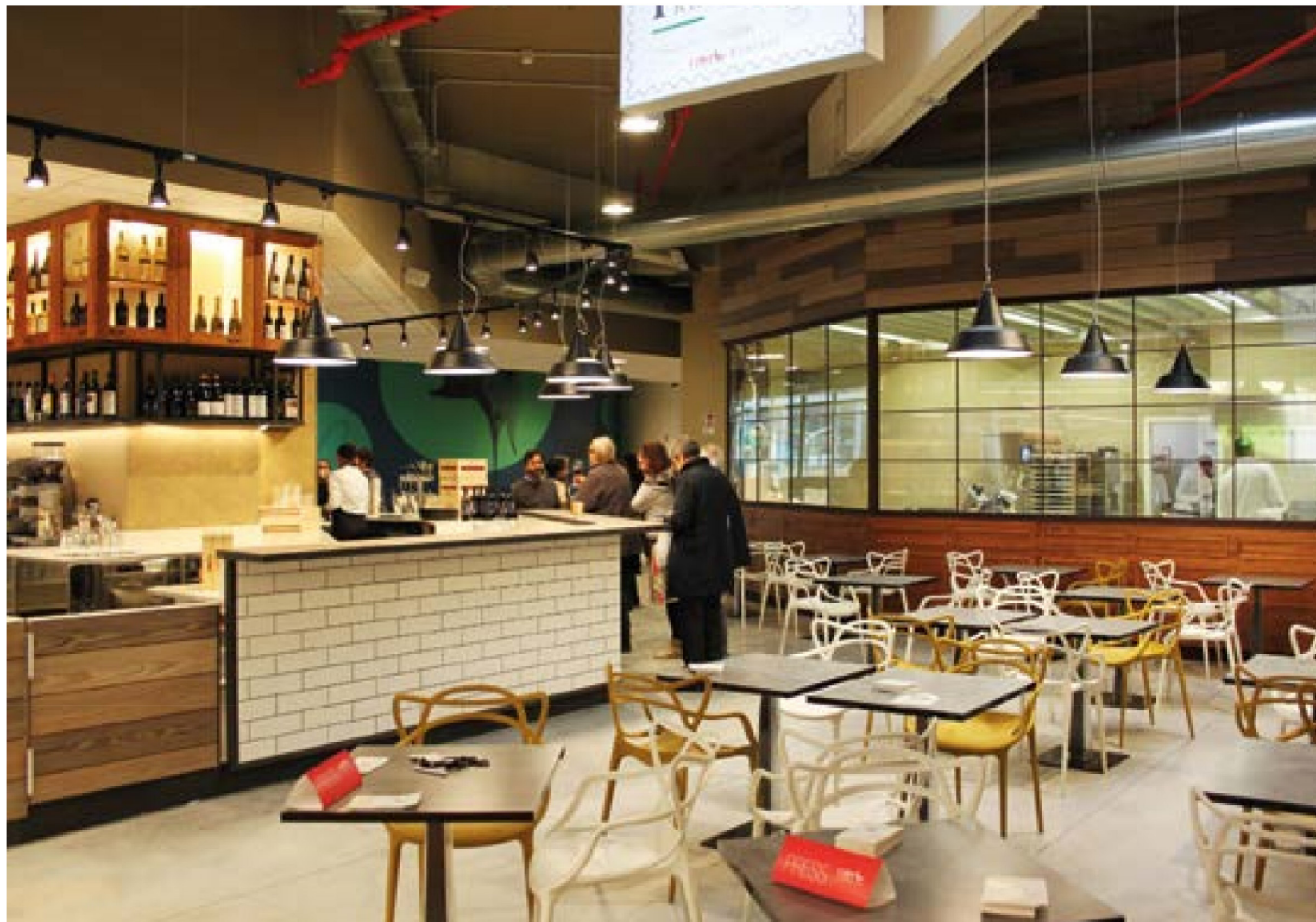
Interior of the restaurant, Bell'Italia Camst for Eataly, Bologna

Arredo Uno presents a completely new visual language with dedication, great care, passion and handcrafted quality to create bespoke designs for national and international contractors