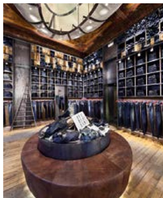
DeN Store in Verona, interior detail

This success will soon have repercussions on the productive platform as well, so much so that, recently, they have undertaken a large development project centred on doubling company spaces. Growth which has now become necessary to allow Arredo Uno to expand its